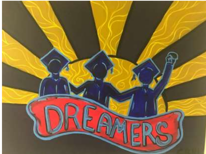
TABLE OF CONTENT AND LINKS

ART BY GABRIEL CARDENAS -UCSB ALUMNUS (2017) WITH LA CUMBRE JUNIOR HIGH 8 TH GRADE CLASS OF 2017